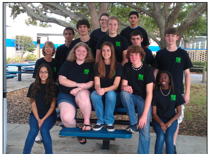
Student Working Against Tobacco Clubs in Highlands County will be active participants in the Tobacco Free Partnership, taking leadership roles as the coalition works on policy changes to limit youth access to tobacco products.